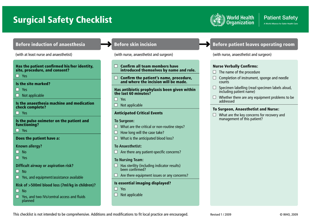
Figure 2. WHO surgical safety checklist, 2009

two multinational trials the checklist use in HIC was double that of low-income countries, but the greatest benefits from checklist use were found in emergency surgery in low- and middle-income countries.8 Ethiopia could stand out as a model for low-income countries. The Federal Ministry of Health recognizing the unmet need for surgery and pioneered the Saving Lives Safe Surgery initiative. In eight different areas also including the implementation of the WHO safe surgery checklist has seen transformation in health care including improved surgical outcomes.<sup>18</sup> Ethiopia seems to be an example for other resource limited countries, in overcoming the barriers towards implementation of SSC use by enthusiastic leadership, development of appropriate strategies and training programs in implementing the WHO safe surgery checklist.